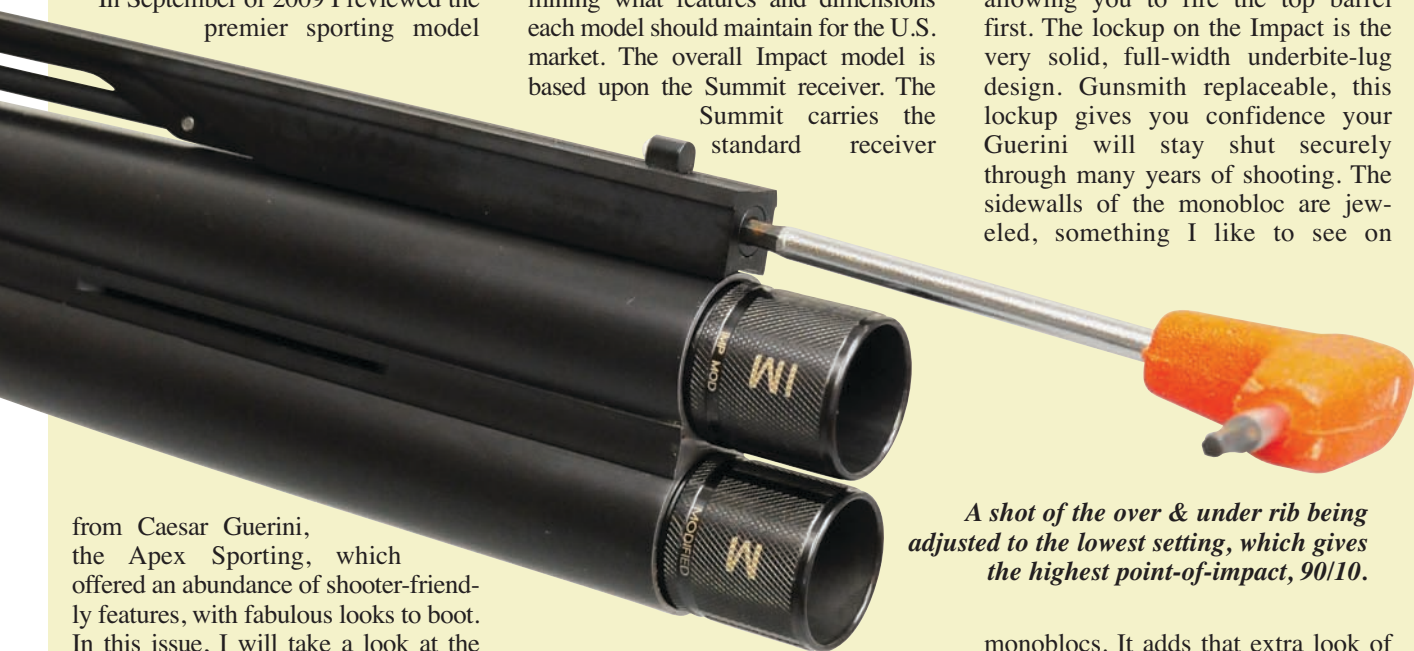
A shot of the over & under rib being adjusted to the lowest setting, which gives the highest point-of-impact, 90/10.

Within the body of the safety lies the barrel selector. Move the center bar to the left, and one red dot is exposed, meaning you will fire the bottom barrel first. Move it to the right, and two red dots are exposed, allowing you to fire the top barrel first. The lockup on the Impact is the very solid, full-width underbite-lug design. Gunsmith replaceable, this lockup gives you confidence your Guerini will stay shut securely through many years of shooting. The sidewalls of the monobloc are jeweled, something I like to see on