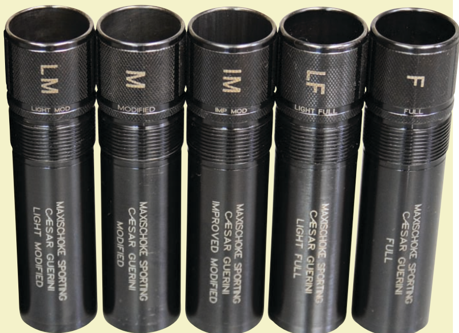
The Guerini Maxis Chokes included with the Impact Trap Combo provide smooth installation, easy identification and great performance.

Barrels accompanying the Impact Trap Combo are chambered for 2¾" shells and have 5"-long, dual conical forcing cones. The Impact's barrels are hard industrial chrome-lined within the chambers, bore and even the threaded choke areas at the muzzle. Lined in this manner, the possibility of chokes rusting tight in the muzzles and