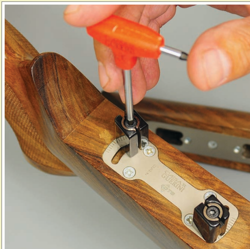
A view of the Impact's adjustable-comb hardware. Lateral movement of the comb is 5/16" and maximum vertical range is .55". This is another component of the Guerini Dynamic Tuning System (DTS).

A few rounds of Doubles with the Light Modified and Modified installed using the NobelSport Trap Golds and Remington Premier STS Light Handicaps gave excellent performances. The Guerini Impact Trap Combo was very pleasant to shoot on Singles and Doubles. The DTS Barrel Balancer was given a ride on one of the rounds of Doubles and did what it's designed to do, give just a hint of forward barrel-weight preponderance. I only had one Balancer, but it was enough to let me feel